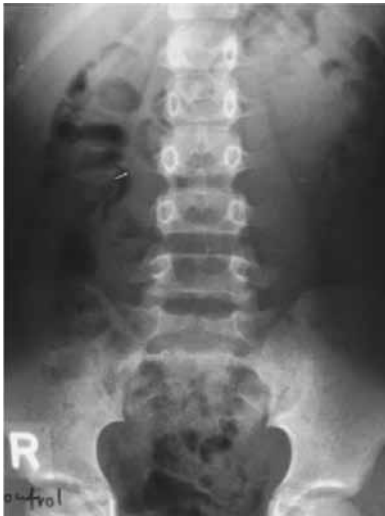
Fig.2: There is a small faint opacity seen in the course of the right upper ureter representing a stone (arrowed)