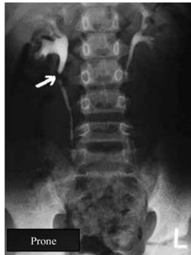
Fig.3: IVU – 15-minute AP film; there is mild right sided hydronephrosis and proximal right hydroureter with a filling defect seen in the right upper ureter (arrowed)

favouring partial right upper ureteric stone obstruction, as shown in Fig.2 and Fig.3. The stone was removed following a flexible ureteroscopic procedure. This report highlights the value of a combined US and a limited series of IVU in children with acute abdominal pain for which the incidence of urolithiasis is escalating among those who reside in the tropics.